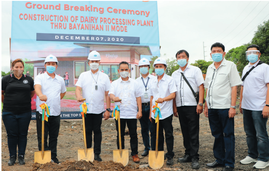
Some of the top officials of DA-PCC and LGU-Orani leading the groundbreaking ceremony of the new dairy processing plant and store held at Orani, Bataan.

Business opportunities and a sure market for milk are soon to benefit carapreneurs in Bataan following the groundbreaking ceremonies for the establishment of a 300 sq m dairy processing plant and outlet in Orani last December 7.