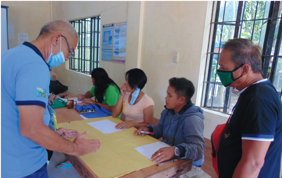
DA-PCC at USF and DA-PCA together with the OPV of Bohol, LGU-Tubigon and LMPC start off the strategic planning workshop to develop a concrete plan for the implementation of CBIN.

The Department of Agriculture-Philippine Carabao Center at Ubay Stock Farm (DA-PCC at USF), Department of Agriculture-Philippine Coconut Authority (DA-PCA), Office of the Provincial Veterinarian (OPV) of Bohol, Local Government Unit (LGU) of Tubigon, and the Libertad Multipurpose Cooperative (MPC) conducted a strategic planning workshop for the implementation of Carabao-based Business Improvement Network (CBIN) in Tubigon last November 5-7.