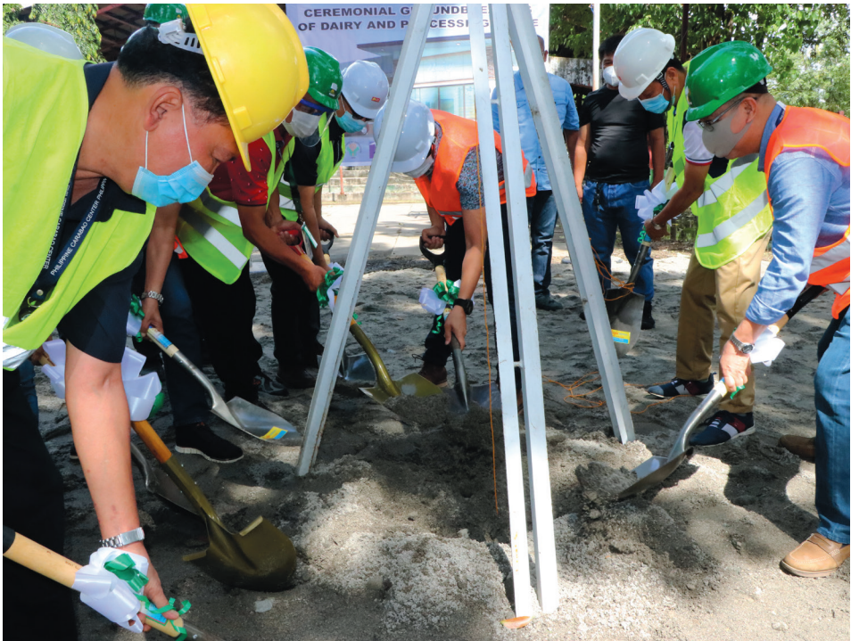
Select DA-PCC, LGU-Victoria and Tarlac province execs lead the groundbreaking of the dairy and processing store in Victoria, Tarlac.

The town of Victoria in Tarlac will soon add the processing of dairy products with carabao's milk to its roster of livelihood opportunities for the town's residents. A ceremonial groundbreaking of dairy and processing store and entrustment of production, processing, and marketing equipment were conducted last October 27 at the Bulwagan ng Kalayaan in Victoria.